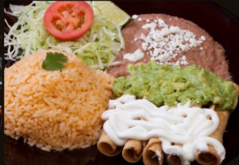
FLAUTAS DE POLLO $11.99

(5) ROLL TORTILLAS WITH SHREDDED CHICKEN SERVED WITH SOUR CREAM AND GUACAMOLE