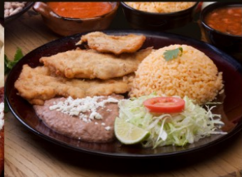
MILANESA DE POLLO $10.99

BREADED CHICKEN BREAST, SERVED WITH RICE, REFRIED BEANS, SALAD, AND 3 TORTILLAS.