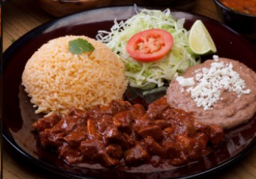
ASADO DE PUERCO $11.49

DELICIOUS PORK MEAT DRESSED WITH A RED SPICY SAUCE, SERVED WITH RICE, REFRIED BEANS AND SALAD.