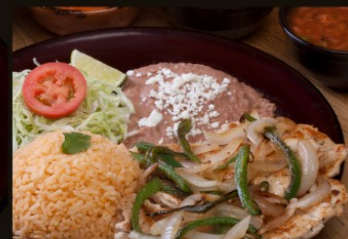
PECHUGA A LA PLANCHA $10.99

GRILLED CHICKEN BREAST, ONIONS AND BELL PEPPER TOPPED, SERVED WITH RICE AND REFRIED BEANS.