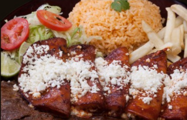
5 ENCHILADAS POTOSINAS $14.99 WITH SLICE BEEF

5 FRESCO CHEESE ENCHILADAS COVERED WITH A DELICIOUS RED SAUCE, SLICED OF MEAT, RICE AND YOUR CHOICE OF REFRIED BEANS OR FRENCH FRIES.