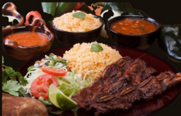
COSTILLAS A LA PARRILLA $15.99

3 GRILLED SHORT RIBS SERVED WITH RICE, SIDE SALAD, PICO DE GALLO AND CHARRO BEANS