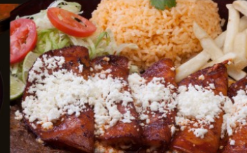
ENCHILADAS REGIAS $10.99

5 FRESCO CHEESE ENCHILADAS COVERED WITH A DELICIOUS RED SAUCE SERVED WITH RICE AND YOUR CHOICE OF REFRIED BEANS OR FRENCH FRIES.