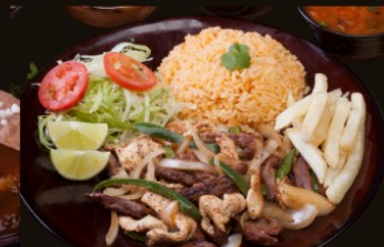
MIX BEEF & CHICKEN FAJITAS $13.99

MIXED BEEF AND CHICKEN FAJITAS ALONG WITH ONIONS AND BELL PEPPER, SERVED WITH RICE AND YOUR CHOICE OF REFRIED BEANS OR FRENCH FRIES.